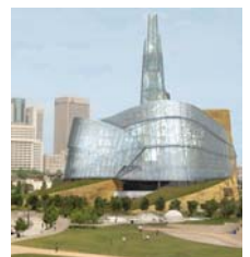
● Canadian Museum for Human Rights 2012