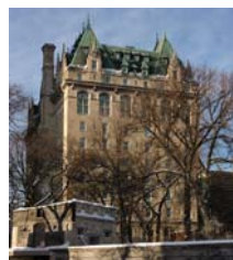
● Hotel Fort Garry 1913