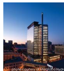
● Manitoba Hydro 2009