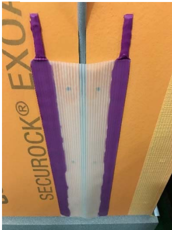
j. Bridging a joint in a wall

ABAA has developed material requirements and physical properties for different air barrier types. The requirements include the air leakage rate of the material and the air leakage rate of the material installed into a building assembly. The requirements go beyond simple air leakage tests. They include requirements which indicate if a material will perform as intended and, to some extent, that the material will be durable over the service life of the building. As many of the materials also can provide the water resistance function, tests that address water resistance are included. Each material is also tested to determine the water transmission rate and the Perm rating for the material is provided.