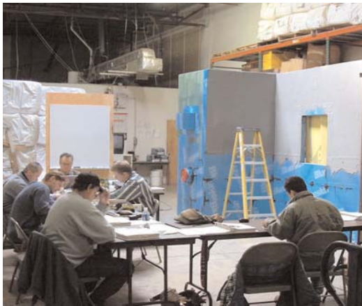
1. Air barrier training class

Each individual learns differently. For some classroom instruction works for them and they can translate what has been taught to real world conditions on the construction site. However, for the majority of people, they learn the best and retain what they have been taught by doing things. A good training course combines some classroom with hands on instruction. You learn the best by hearing things, seeing things and doing things.