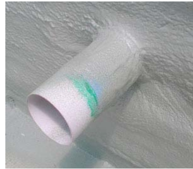
h. Properly detailed round penetration

Finally, terminations need to be designed. This occurs when one air barrier material terminates on another air barrier material. An example of this is when a wall air barrier material terminates on a poured concrete foundation. The poured concrete is the air barrier material for the foundation, so for many projects, there is no need to add an additional air barrier material over the poured concrete. Of course you need to deal with all joints in the poured concrete and install materials that will make them air tight but allow for movement. The termination may need to be mechanically fastened and a sealant may need to be installed on the edge of the air barrier material. The details will depend on the type of air barrier material that has been used.