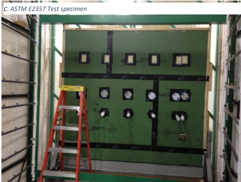
C. ASTM E2357 Test specimen

fleshed out to actual quantifiable numbers. The durability of the air barrier materials, especially materials that will be buried in the wall, needs to be determined and a proper protocol for the accelerated aging of the materials needs to be developed. Research is needed to show the loads imposed upon building and to show how these loads increase when the building is greater than three stories in height. The current loads in ASTM E2357 were developed for 80% of the buildings across the United States that are three stories or less.