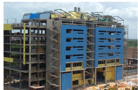
o. Completed air barrier project

For example, why would you have a project inspection on the air barrier system if you have never taught the installer on how to install the materials and confirmed their knowledge, skills and abilities through a certification program? How do you resolve differences if you don't have proper standards and specifications? Why would you expect a material to perform if test methods and performance levels have not been determined for that type of material? The questions just go on and on.