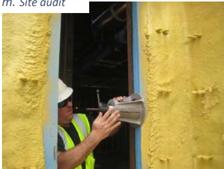
m. Site audit

Specialized inspections or audits are where you focus on a specific part of the building. Of course you cannot have blinders on and say well I'm only looking at the air barrier so I will ignore the water resistive barrier. A specialized inspection, like an air barrier audit, does focus on the details of that particular part of the building enclosure. By being a specialized activity, you have a person who has more and better knowledge of the function that is being audited and the person