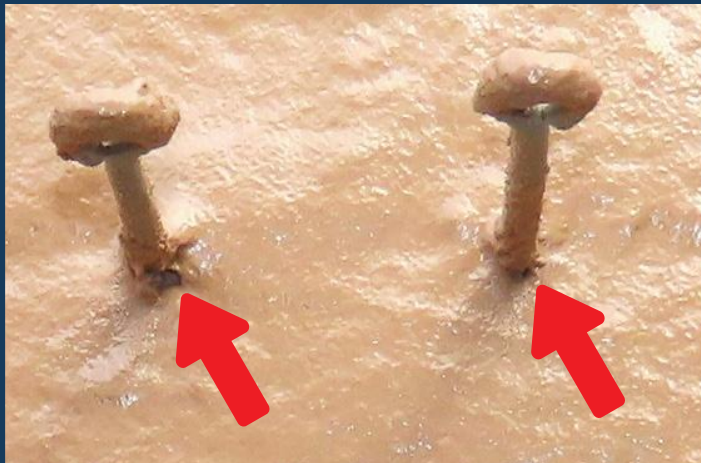
Gaps in the membrane @ the pintle.

CMU substrates are more challenging to coat because of the CMU's porosity. As a result, the liquid material will typically take one or two additional coats to achieve proper thickness.