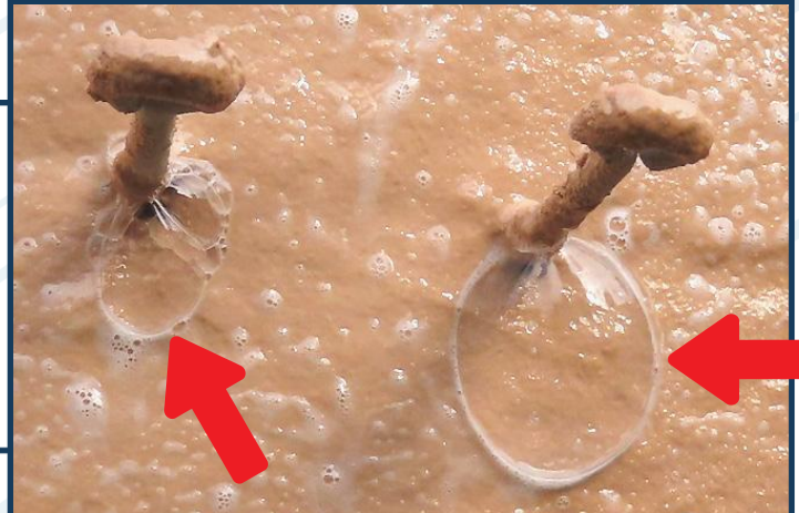
Bubbles coming from the gaps.

We recently started pre-coating the masonry pintles, taking the time to detail each penetration before the spray or roll installation. We saw a substantial benefit to the installation, with less failure and rework.